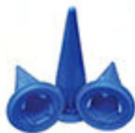
Self-puncturing cone P/N: PUNCTURELG