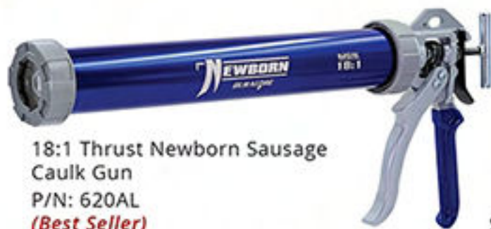
18:1 Thrust Newborn Sausage Caulk Gun P/N: 620AL (Best Seller) Various Colors Available