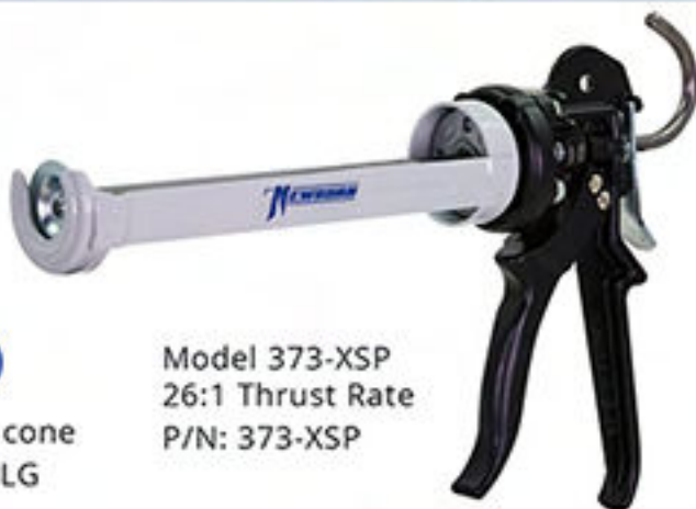
Model 373-XSP 26:1 Thrust Rate P/N: 373-XSP