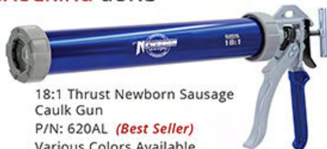
18:1 Thrust Newborn Sausage Caulk Gun P/N: 620AL (Best Seller) Various Colors Available