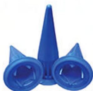
Self-puncturing cone P/N: PUNCTURELG