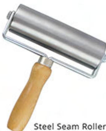
Steel Seam Roller Double Fork 2" x 6" P/N: GSRSTEEL6