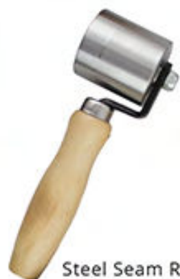
Steel Seam Roller Single Fork 2" x 2" P/N: GSRSTEEL2