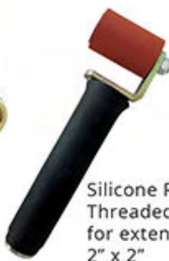
Silicone Roller w/ Threaded Handle for extension pole 2" x 2" P/N: GSR2THD