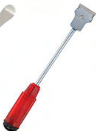
11.5" long reach scraper to remove stickers P/N: LRSCRAPER