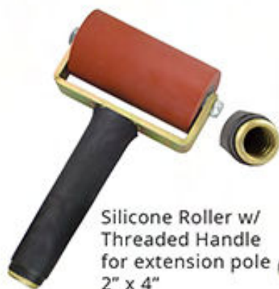
Silicone Roller w/ Threaded Handle for extension pole 2" x 4" P/N: GSR4THD