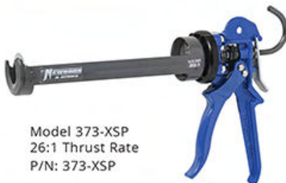
Model 373-XSP 26:1 Thrust Rate P/N: 373-XSP