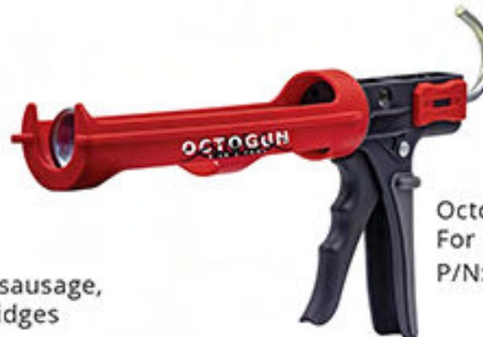
OctoGun For silicone only P/N: 208D