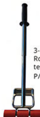
3-Section Silicone Roller with telescoping handle P/N: HANDROLL