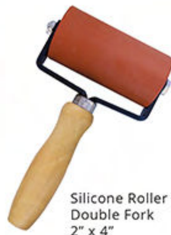
Silicone Roller Double Fork 2" x 4" P/N: GSR4