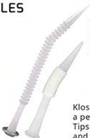
The Flex Nozzle extends up to 12" long. Ideal for 10 oz and 29 oz tubes. P/N: FLEXNOZZLE