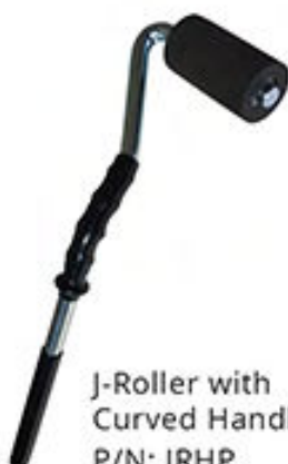
J-Roller with Curved Handle P/N: JRHP