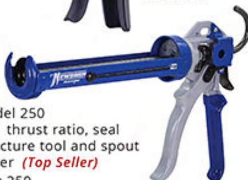
Model 250 18:1 thrust ratio, seal puncture tool and spout cutter (Top Seller) P/N: 250