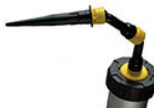
BeadBuddy45™ A nozzle system for hard to reach places. Extends with various included attachments, articulates at 45° angle and can be used on bulk and sausage tools. P/N: BB45