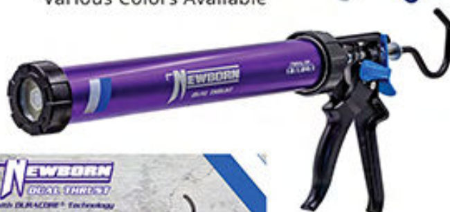
Dual Thrust Caulk Gun Compatible with 20 oz. sausage, 20 oz. bulk, 10 oz. cartridges P/N: 360-DT P/N: 720AL-DT (Change between 12:1 Thrust Ratio and 24:1 Thrust Ratio)