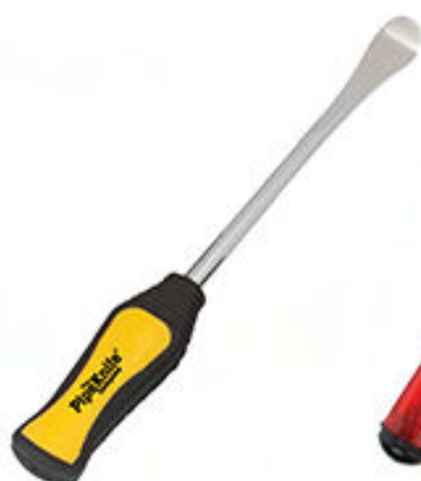
Extra strong pry bar P/N: LEVPRYBAR