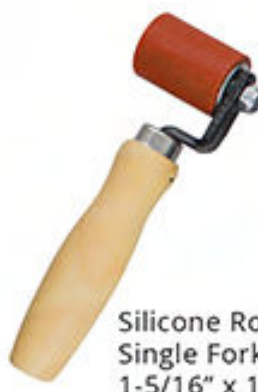
Silicone Roller Single Fork 1-5/16" x 1-3/4" P/N: GSR2