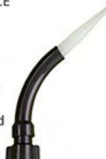
Klos Kaulk provides a permanent bend. Tips can be removed and replaced. P/N: KLOSKAULK