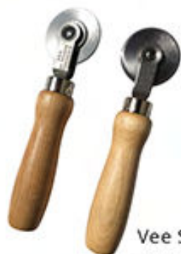
Vee Seem Rollers 1/16" w P/N: VEE16 1/4" w P/N: VEE4