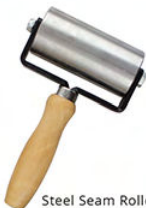
Steel Seam Roller Double Fork 2" x 4" P/N: GSRSTEEL4