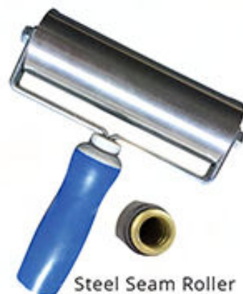
Steel Seam Roller Threaded Fork 2" x 6" P/N: GSR6THD